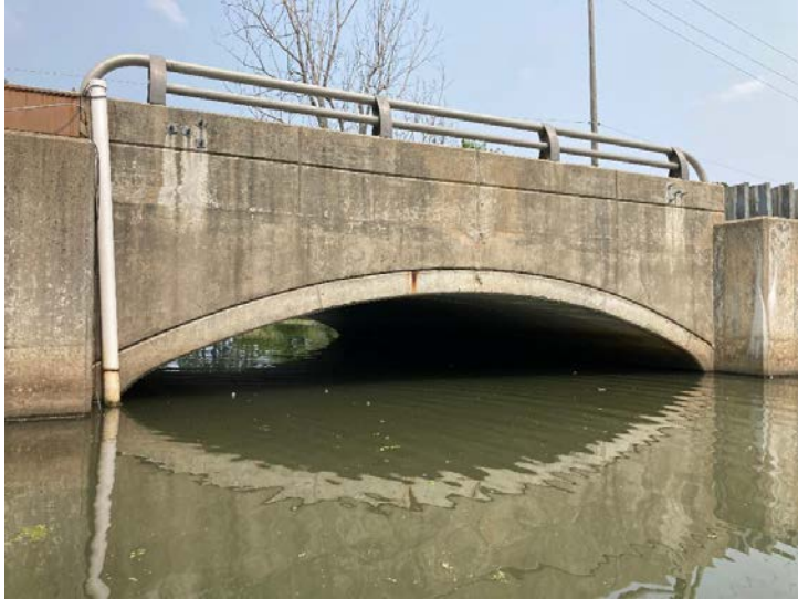
Document Name: IMG_4623.JPG Category: Elevation Span Number: Comments: South elevation