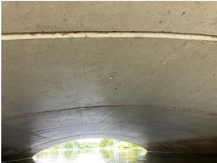
Document Name: IMG_4626.JPG Category: Culvert Span Number: Comments: Soffit