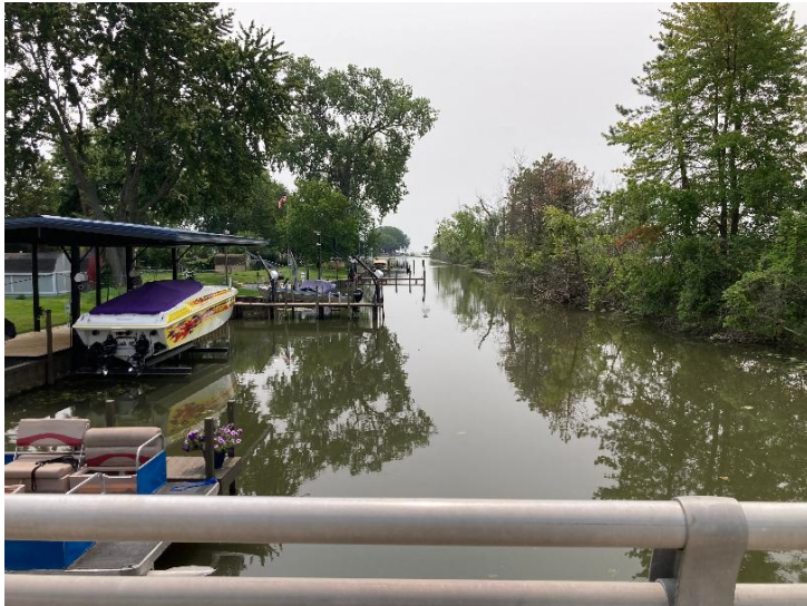
Document Name: IMG_4619.JPG Category: Channel Span Number: Comments: South channel