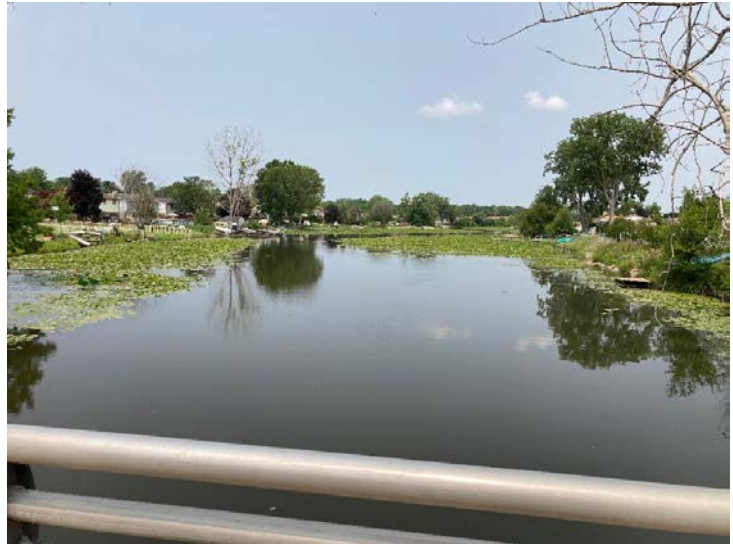
Document Name: IMG_4622.JPG Category: Channel Span Number: Comments: North channel