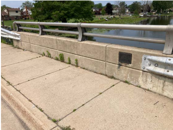
Document Name: IMG_4621.JPG Category: Railing Span Number: Comments: North rail