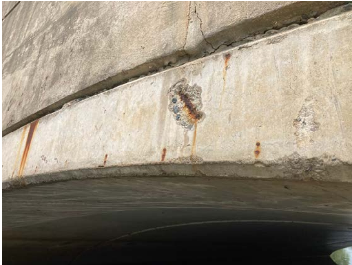
Document Name: IMG_4624.JPG Category: Culvert Span Number: Comments: STS is fascia