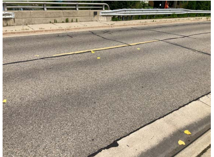
Document Name: IMG_4616.JPG Category: Deck Span Number: Comments: HMA surface