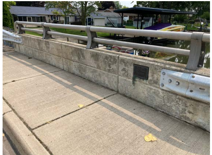
Document Name: IMG_4618.JPG Category: Railing Span Number: Comments: South rail