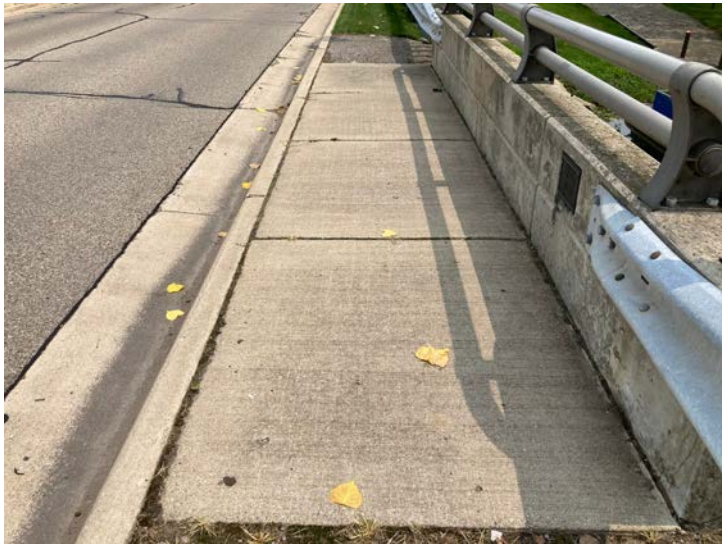
Document Name: IMG_4617.JPG Category: Deck Span Number: Comments: South sidewalk