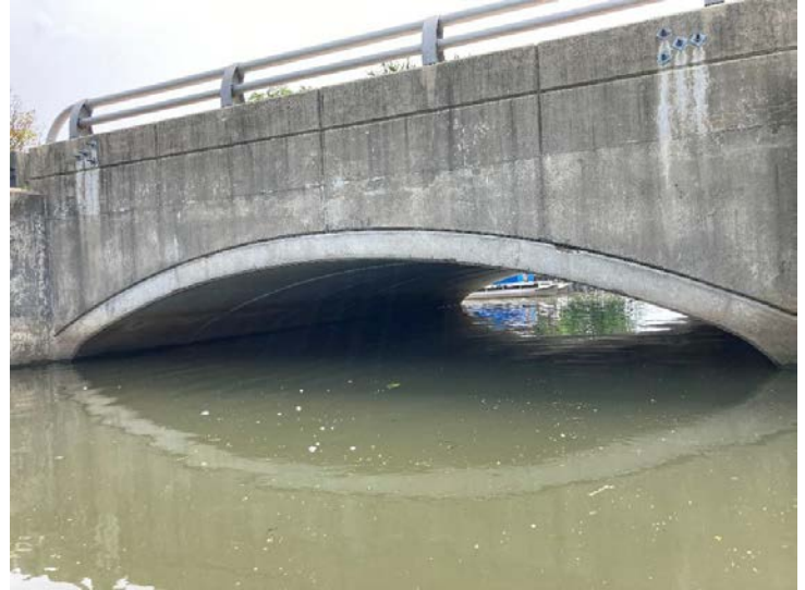
Document Name: IMG_4630.JPG Category: Elevation Span Number: Comments: North elevation