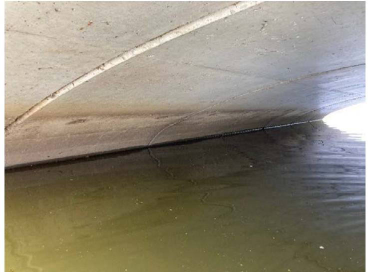
Document Name: IMG_4625.JPG Category: Culvert Span Number: Comments: West abutment