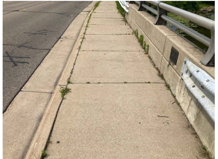
Document Name: IMG_4620.JPG Category: Deck Span Number: Comments: North sidewalk