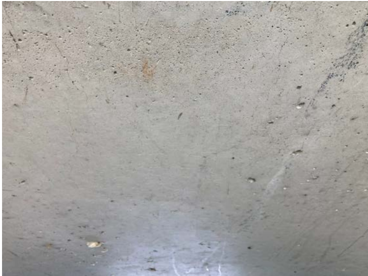
Document Name: IMG_4628.JPG Category: Culvert Span Number: Comments: HL transverse cracks in soffit