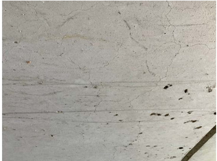
Document Name: IMG_4629.JPG Category: Culvert Span Number: Comments: HL map cracks in soffit