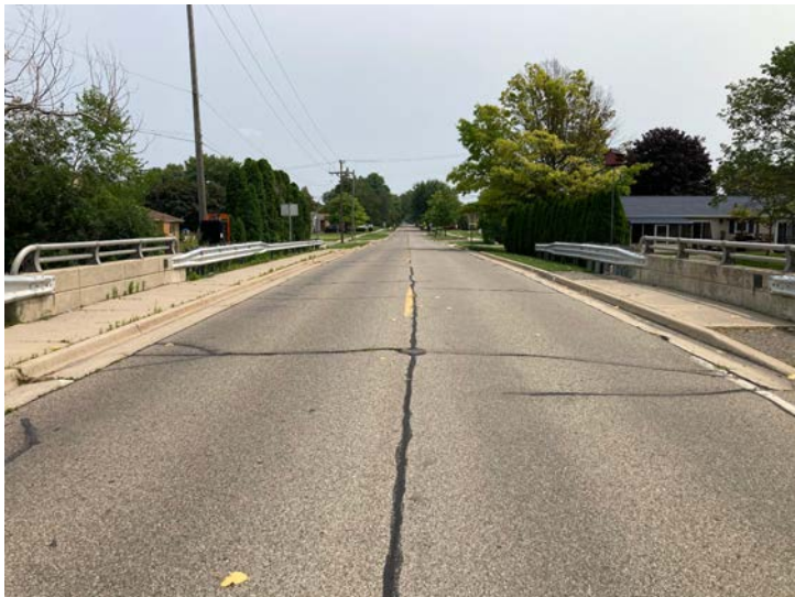
Document Name: IMG_4615.JPG Category: Approach Span Number: Comments: Looking east through structure