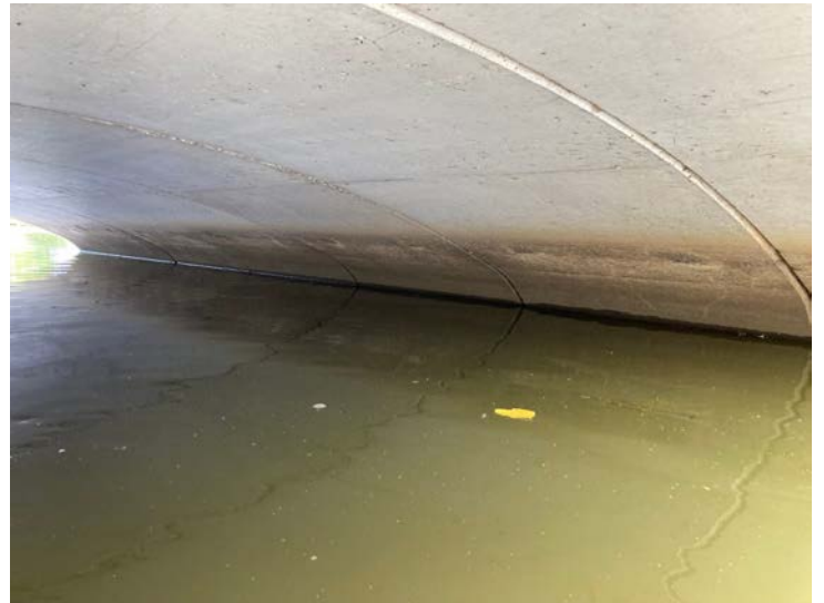
Document Name: IMG_4627.JPG Category: Culvert Span Number: Comments: East abutment