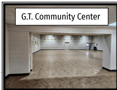
G.T. Community Center

Rental forms can be found on our City Website: www.cityofgibraltarmi.gov