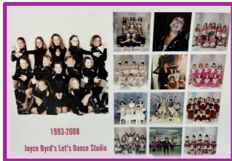
'Let's Dance Studio' Exhibit 1993-2008

The Museum is only open the 1 st Sunday of each month from 2:00pm-4:00pm. Appointments and special tours are available upon request!